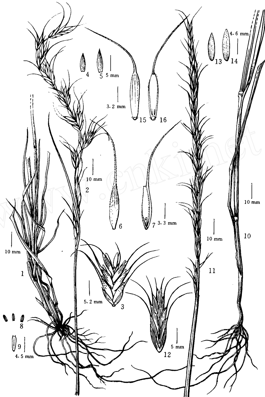
图2 1~9. 弯曲鹅观草;10~16. 粗状鹅观草。1,10. 植株下部;2,11. 花序;3,12. 小穗;4,13. 第一颖片;5,14. 第二颖片;6,15. 第一小花背面;7,16. 第一小花腹面;8. 花药;9. 颖果。(王颖绘) Fig. 2 1~9. Roegneria flexuosa ; 10~16. Roegneria crassa . 1, 10. basal portion of plant; 2, 11. spike; 3, 12. spikelet; 4, 13. first glume; 5, 14. second glume; 6, 15. dorsal view of the first floret; 7, 16. ventral view of the first floret; 8. anthers; 9. caryopsis.